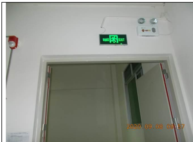
Evacuation route with sign