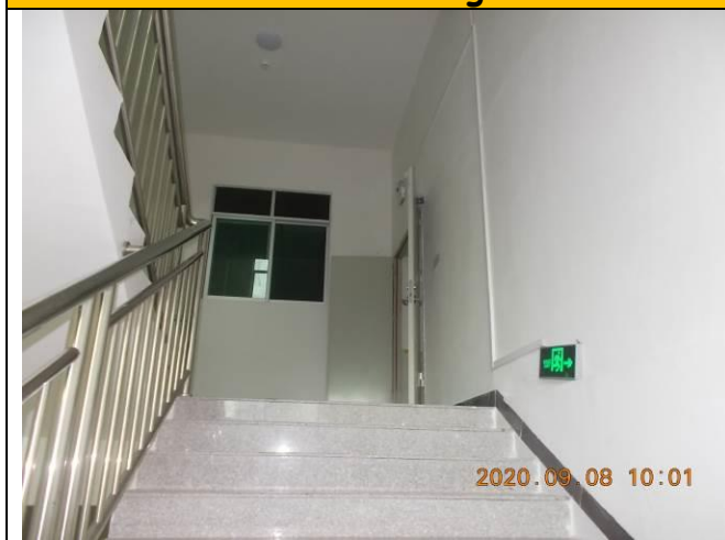
Exit sign and emergency light