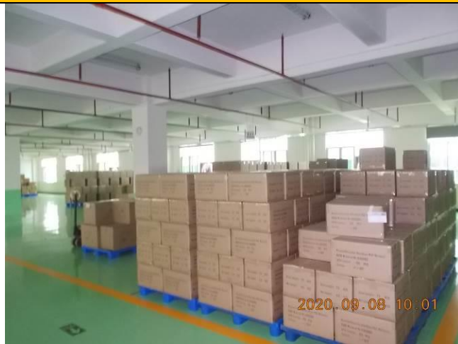
Finished goods warehouse