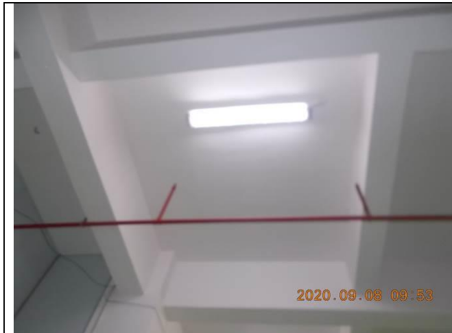
Staircase with emergency light and evacuation sign