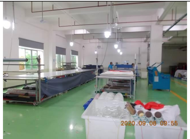
High frequency workshop