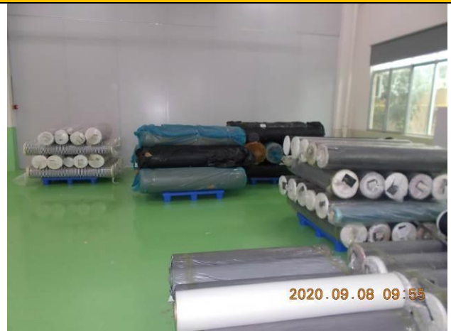
Febric material warehouse